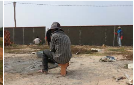
Finishing building 130cm high of wall