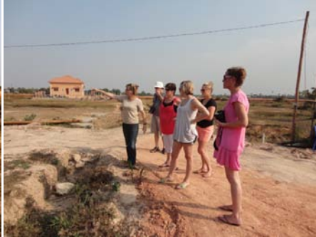
Family MCKENZIE & MARTIN