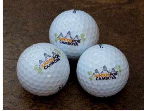
Golf Balls & CARMEN CARMONA-Spain