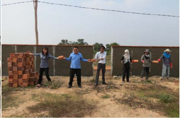
The Land Title in its land