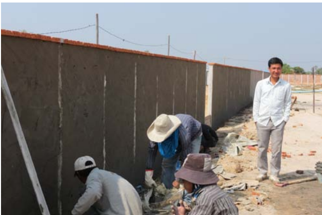
SIENG, Constructor & Team