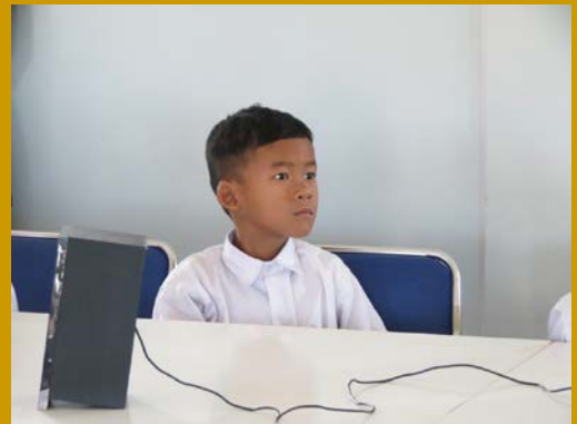
Listening carefully what is going on!!.