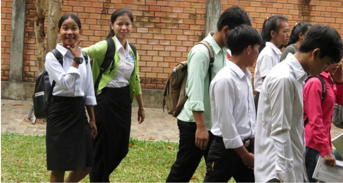
S y CH walking in the present towards their futures !!!.